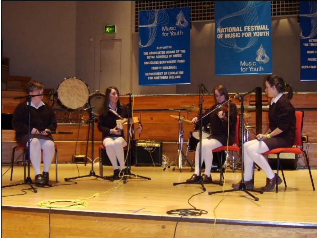
The Senior Irish Music Group, Show off their talents in Birmingham

The Senior Irish Music Group had a very successful and enjoyable visit to Birmingham on 13 July.