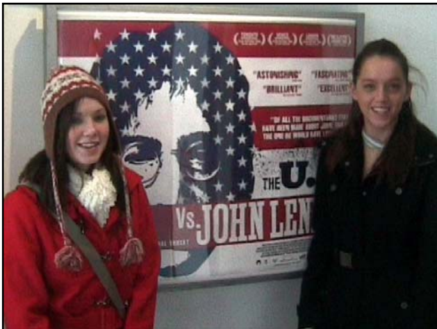
Year 14 students at QUB Film Theatre

Pupils talk about their experiences on a recent visit to Queen's University Belfast and find out how a film is made with particular reference to THE MIGHTY CELT