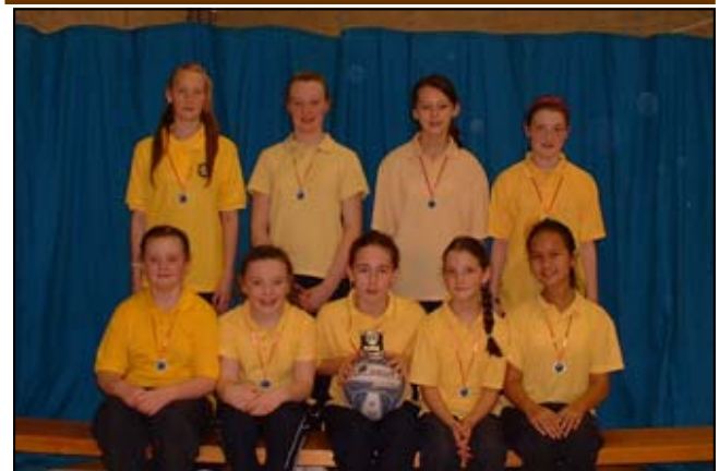
Year 8D, winners of the Year 8 Intra School Netball tournament