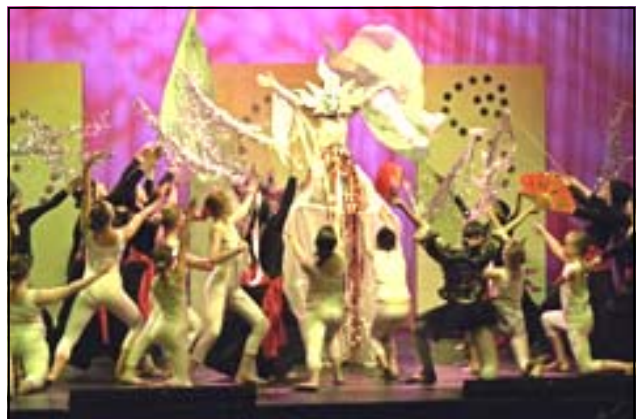
Our girls giving it their all—"Into The Light" in Grimsby

Congratulations to everyone involved, including our Technology Department who made the set and to our Physical Education Department who provided rehearsal space.