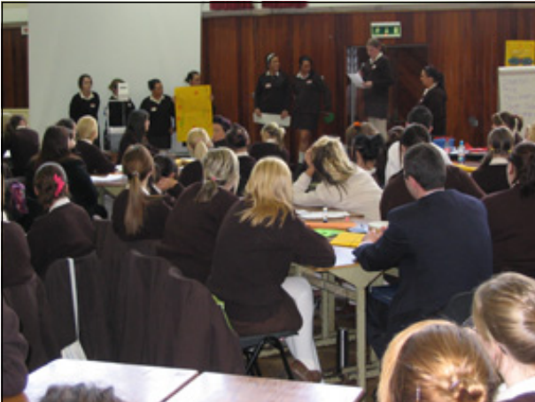
Pupils and invited guests at the Business Insight Conference hosted by St Louise's

On Friday 5th May 2006 Year 13 students and twenty local businesses participated in a Business Insight Conference.