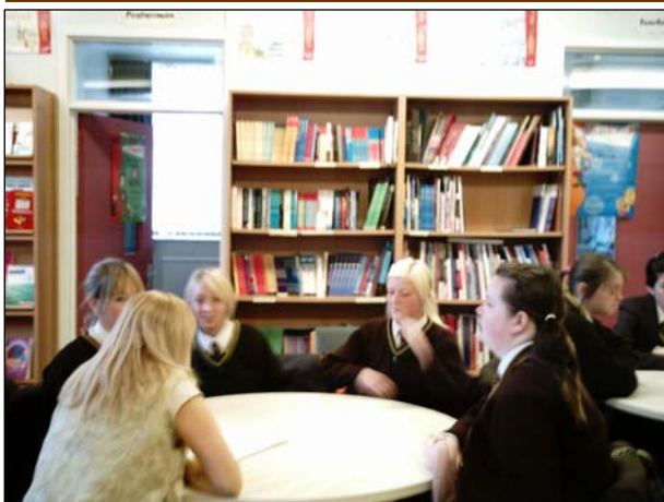
Year 13 pupils pictured in the Careers Suite during the Mentoring Programme

Eighty year 12 pupils took part in our first GCSE mentoring programme during terms 2 and 3. The scheme involved a team of form teachers and year 14 pupils working with small groups of 5-6 pupils in an effort to motivate and support the girls during preparation for their exams.