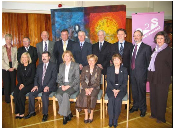
'Specialist Status' Schools with the Education Minister