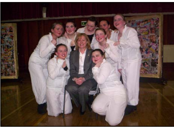
Our drama girls performed their A Level Practical based on 'School for Scandal'.