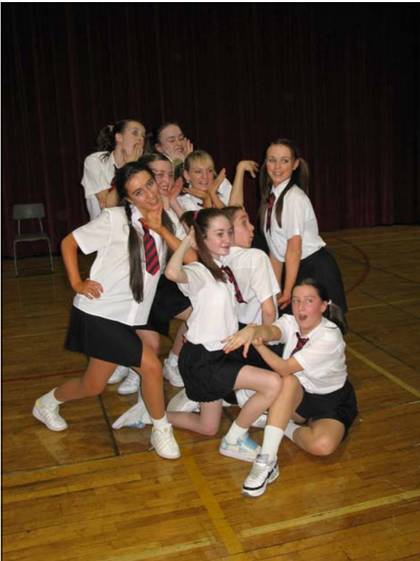
A fine performance from our Dance and Drama students who kept the viewers captivated