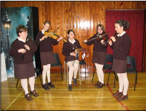
An Irish Traditional welcome for the Education Minister and all the invited guests