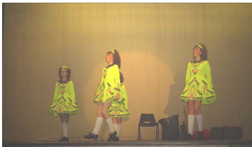
Irish Dancers entertain our visitors