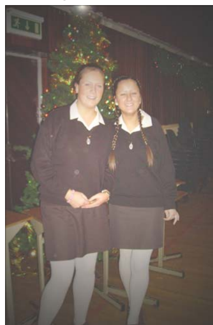
Two Year 13 Marillacs take a well-earned break!