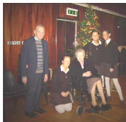
Striking a pose under the tree

Grainne Family Unit wrote to say "Many, many thanks for the lovely hampers .. They will be much appreciated. Thank you for the trouble you went to" .