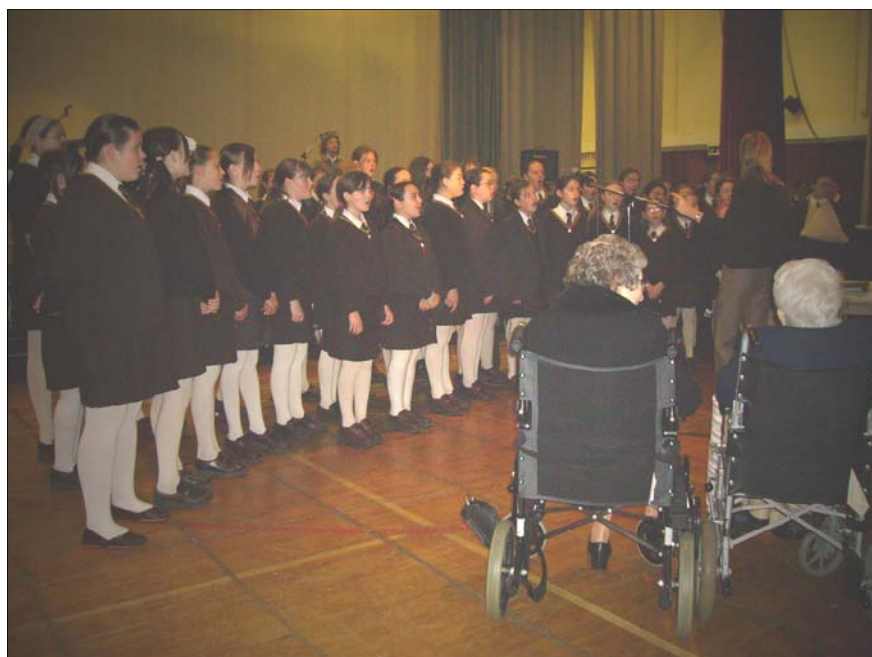
The Choir sing for our visitors as they arrive

The Marillac Society had a very busy Christmas season this year. A lovely party was held for the senior citizens in the Assembly Hall on 30 November and over 200 Christmas hampers and other gifts were distributed.