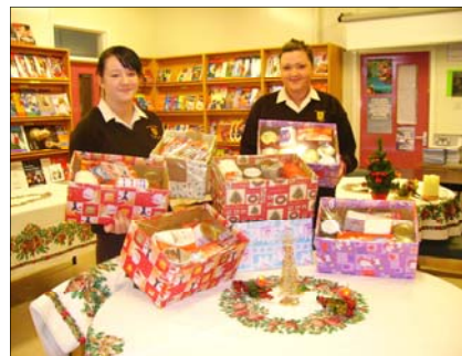
The Marillac Christmas Hampers