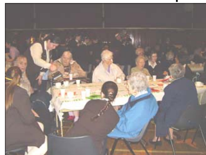
The Party Begins